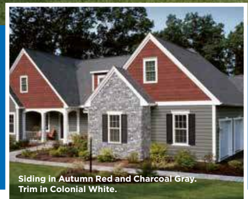
Siding in Autumn Red and Charcoal Gray. Trim in Colonial White.