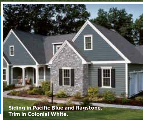
Siding in Pacific Blue and flagstone. Trim in Colonial White.

Roofing: Landmark Shingles in Georgetown Gray.