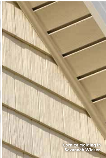
Cornice Molding in Savannah Wicker.