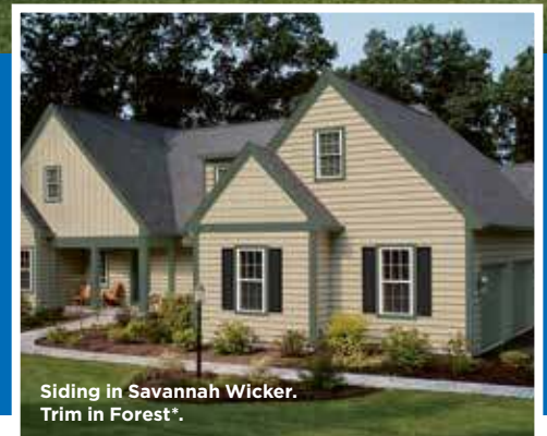
Siding in Savannah Wicker. Trim in Forest*.