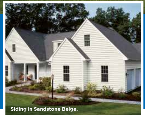
Siding in Sandstone Beige.