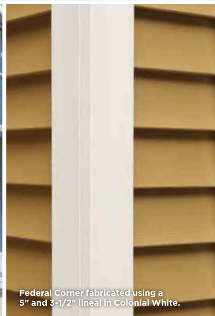
Federal Corner fabricated using a 5" and 3-1/2" lineal in Colonial White.