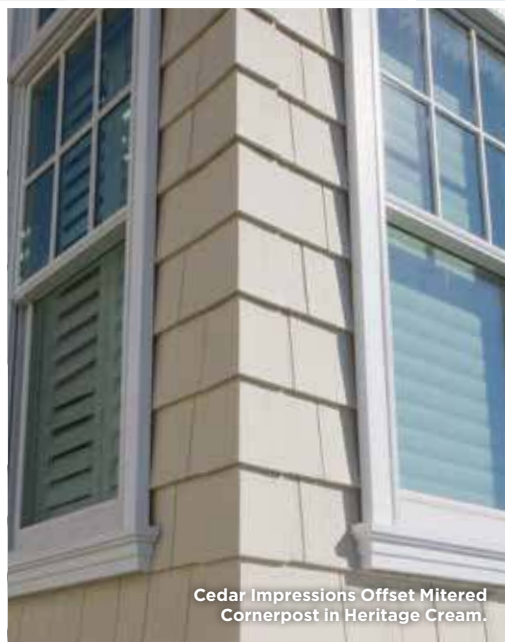
Cedar Impressions Offset Mitered Cornerpost in Heritage Cream.