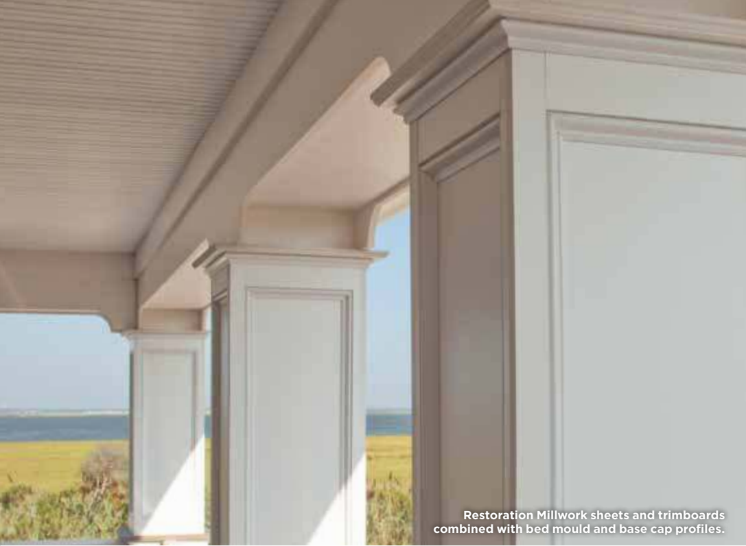
Restoration Millwork sheets and trimboards combined with bed mould and base cap profiles.