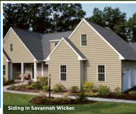
Siding in Savannah Wicker.

Siding: CedarBoards™ Single 7" Clapboard in Sterling Gray. Trim: Vinyl Carpentry® in White and Sterling Gray. Roofing: Landmark™ Shingles in Georgetown Gray.