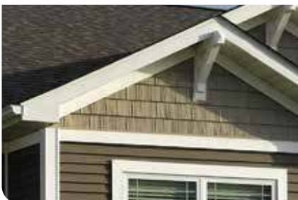
VINYL CARPENTRY® TRIM