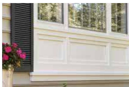
PVC EXTERIOR TRIM & BEADBOARD