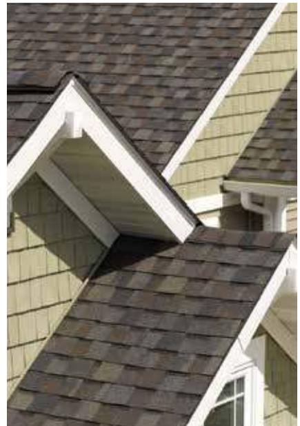
ROOFING AND VENTILATION