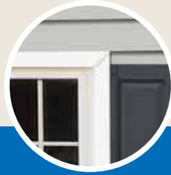
3-1/2" Lineal with miter cut corners