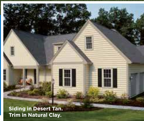
Siding in Desert Tan. Trim in Natural Clay.

Siding: CedarBoards Single 7" Clapboard and Board & Batten Single 8" in Sterling Gray with Cedar Impressions Double 7" Straight Edge Perfection Shingles in Charcoal Gray. Trim: Vinyl Carpentry* & Restoration Millwork* Roofing: Landmark* Shingles in Georgetown Gray.