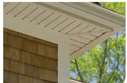
VINYL & METAL SOFFIT