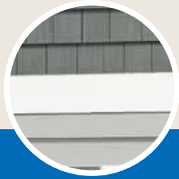
Restoration Millwork* trimboard*