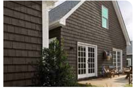
POLYMER SHAKES & SHINGLES