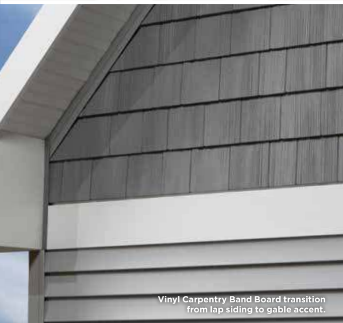
Vinyl Carpentry Band Board transition from lap siding to gable accent.

Trim: Vinyl Carpentry® & Restoration Millwork®.