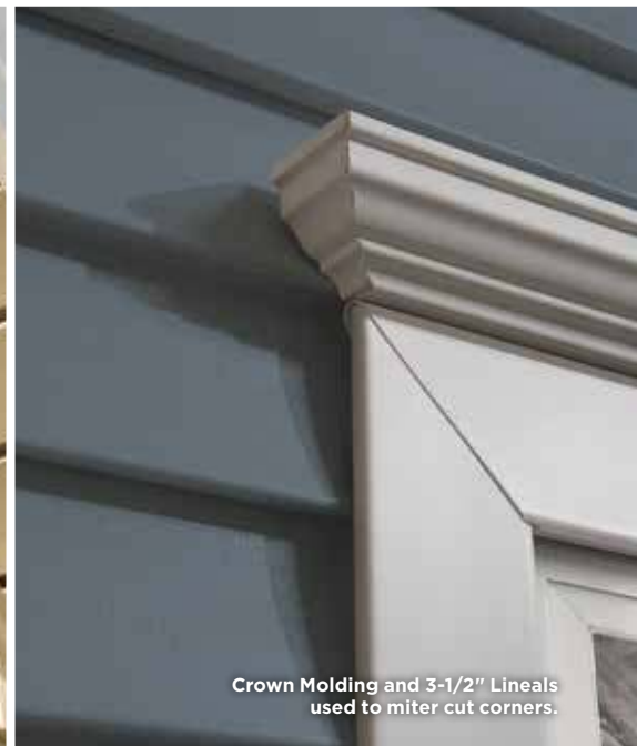
Crown Molding and 3-1/2" Lineals used to miter cut corners.