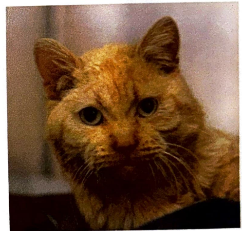
Snacks: rescued by PAWS and on his way to a new life!

PAWS also works to keep animals out of shelters in the first place through our low-cost Spay/Neuter and Wellness Clinics, serving pet owners who could not otherwise access or afford veterinary care, and our Safety Net program, which offers food, supplies, temporary housing, and support to protect those precious bonds. Every day, our services make it possible for beloved dogs and cats to stay with their families rather than be surrendered. Our efforts have helped reduce the number of animals entering the city shelter by 54%.